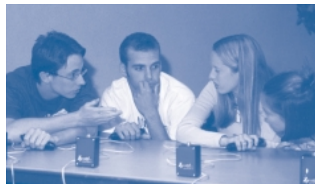
Edina High School Economics Challenge team