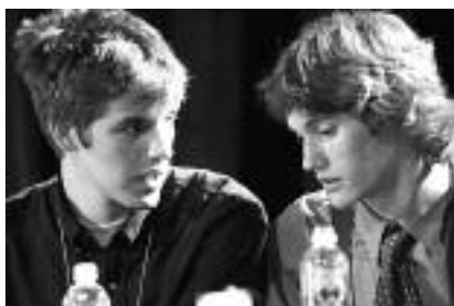
Moorhead High School teammates conferring on an Economics Challenge questions.

Economics Challenge , the national high school competition in economic knowledge and decision-making, is a regular spring activity at many schools throughout Minnesota. Start a new tradition of your own by signing up a team or two for this fun and exciting competition, coming up in early